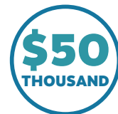
Minimum Average Settlement Cost

ISF employs a holistic approach to Web Content Accessibility Management. This plan includes a proven strategy to Assess, Remediate, and Maintain ADA compliance. ISF is uniquely equipped with skills, experience, and decades of working with government agencies to assist with remediation efforts for web content accessibility.