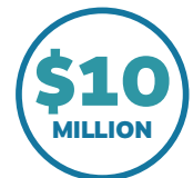
Recent Target Stores Settlement